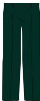
GREEN GIRLS TROUSER