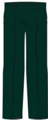
GREEN BOYS TROUSER