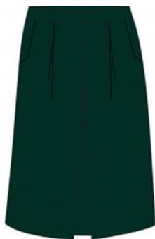
KNEE LENGTH SKIRT