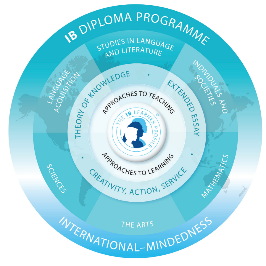
Figure 1 Diploma Programme model

The course is presented as six academic areas enclosing a central core (see figure 1). It encourages the concurrent study of a broad range of academic areas. Students study: two modern languages (or a modern language and a classical language); a humanities or social science subject; a science; mathematics and one of the creative arts. It is this comprehensive range of subjects that makes the Diploma Programme a demanding course of study designed to prepare students effectively for university entrance. In each of the academic areas students have flexibility in making their choices, which means they can choose subjects that particularly interest them and that they may wish to study further at university.