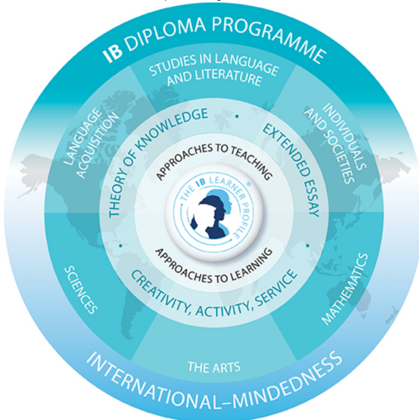
The Diploma Programme model